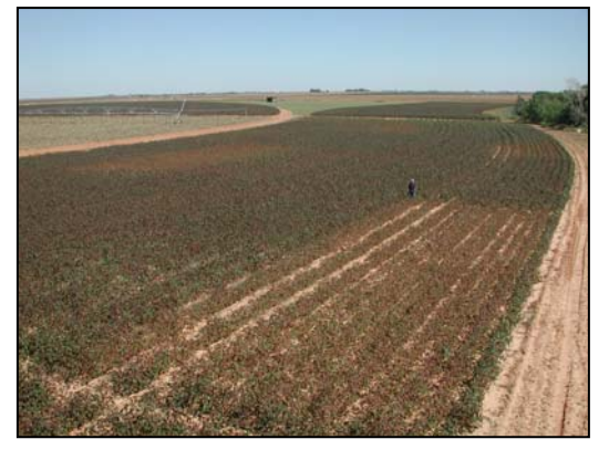
Fig. 2. Visual effect of varying levels of nitrogen application on treatment plots.